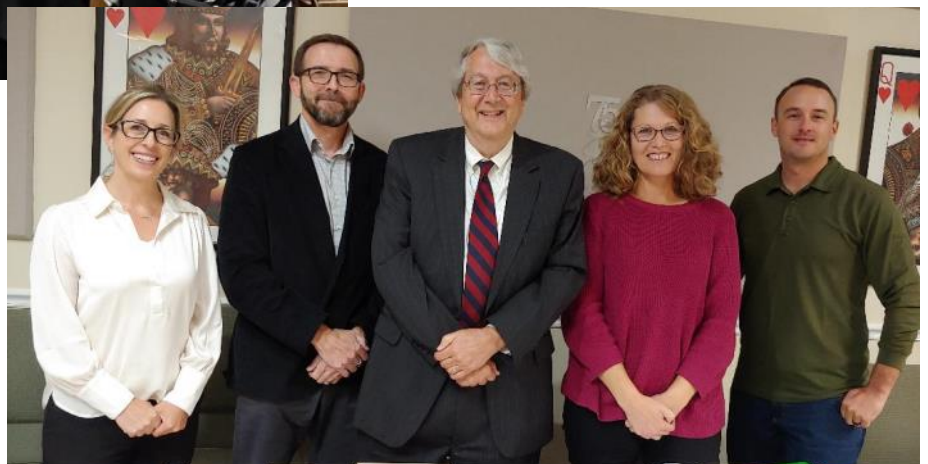
Camp Hill candidates