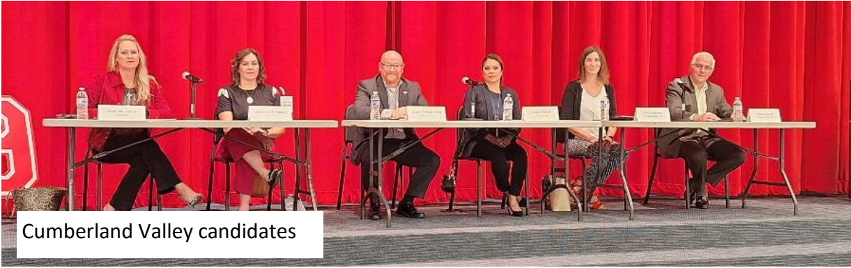
Cumberland Valley candidates