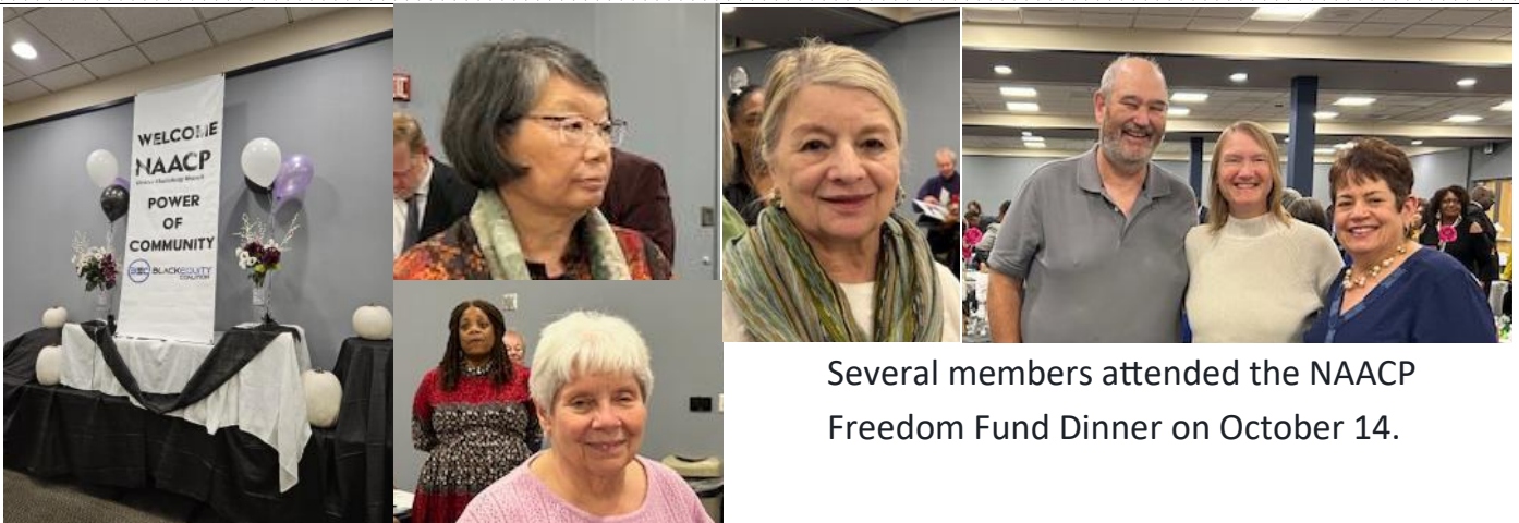
Several members attended the NAACP Freedom Fund Dinner on October 14.